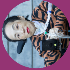
Alice Wong Disability Rights Activist

“Advocacy is not just a task for charismatic individuals or high-profile community organizers. Advocacy is for all of us; advocacy is a way of life. It is a natural response to the injustices and inequality in the world.”